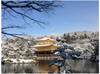
Kinkaku-ji (金閣寺), Kyoto