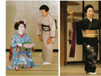
Myako Odori dance (Practise)