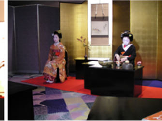
Myako Odori's tea ceremony