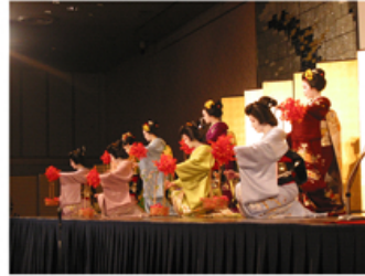
Myako Odori dance (都をどり)

In order to speed up the selection of papers, we request authors to send plain text abstracts, with a maximum of 4000 characters (blanks included). Please avoid the use of images, tables or equations. Abstracts for submission shall be written in English. Abstracts will be reviewed by at least two members of the Symposium Scientific Committee. The material shall be sent by email to the following address: iass2015tokyo@gmail.com