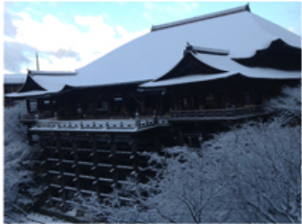
Kiyomizu-dera (清水寺), Kyoto