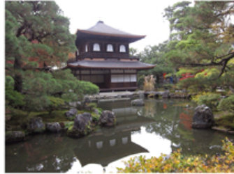
Ginkaku-ji (銀閣寺), Kyoto