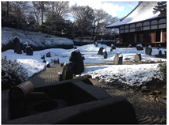
Komyo-in (光明院), Kyoto