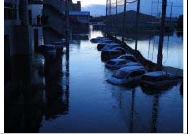
Photo 6: Flooding of the campus from Jozan Canal 190 minutes after the earthquake