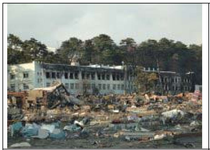
Photo 49: Kadowaki area; an elementary school burnt after the earthquake