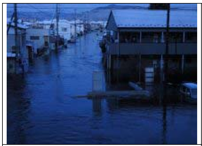
Photo 7: Flooding of the campus from Jozan Canal 190 minutes after the earthquake (2)