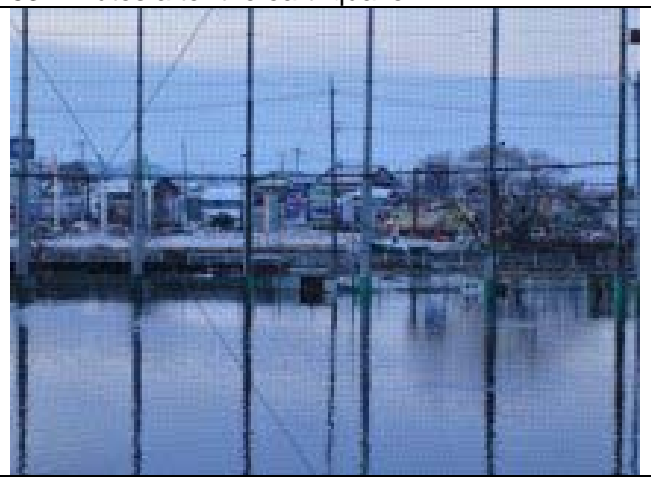
Photo 4: Flooding of the campus from Jozan Canal 113 minutes after the earthquake