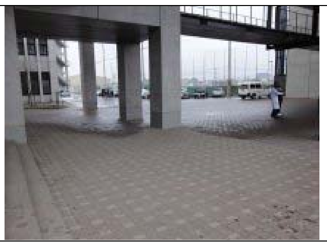
Photo 2: The gate of the high school 33 minutes after the earthquake