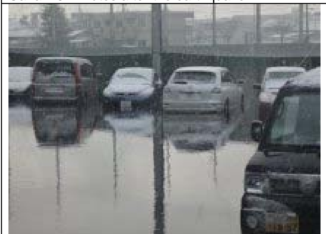
Photo 5: Flooding of the campus from Jozan Canal 59 minutes after the earthquake