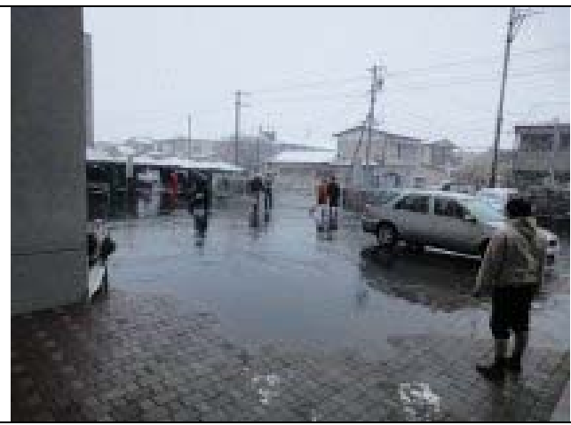
Photo 4: Flooding of the campus from Jozan Canal 53 minutes after the earthquake