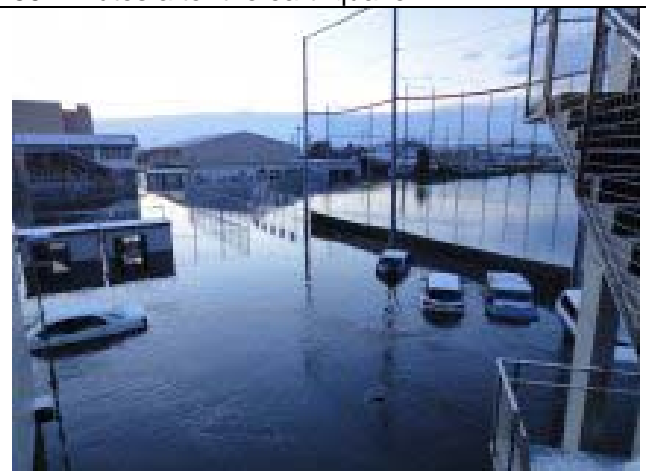
Photo 5: Flooding of the campus from Jozan Canal 113 minutes after the earthquake (2)