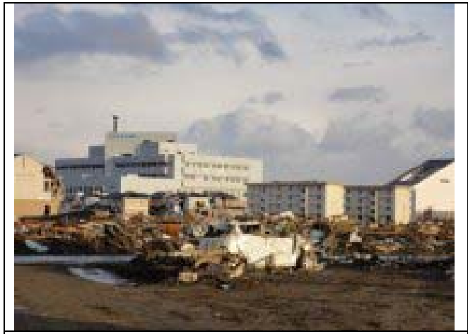
Photo 43: Minami-hama area; Ishinomaki municipal hospital (closed)