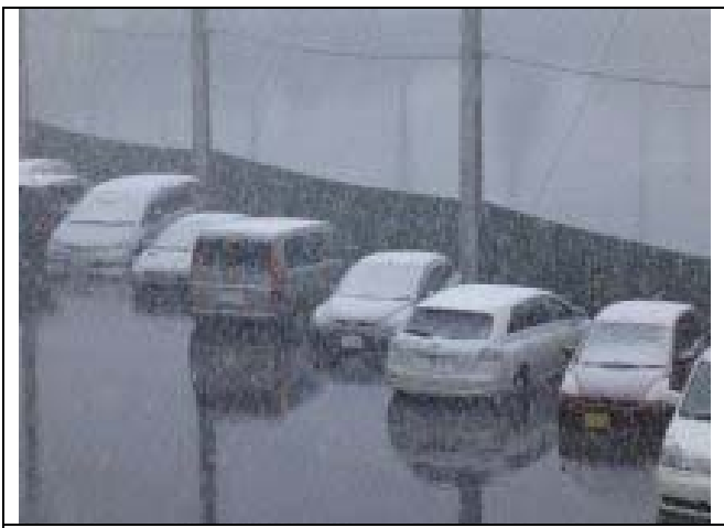
Photo 3: Water came to the campus from Jozan Canal 45 minutes after the earthquake