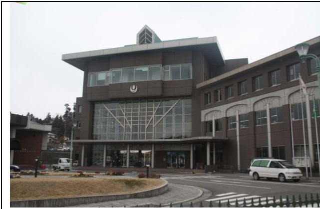
(a) Overall view of the Kurihara City Municipal Office Building