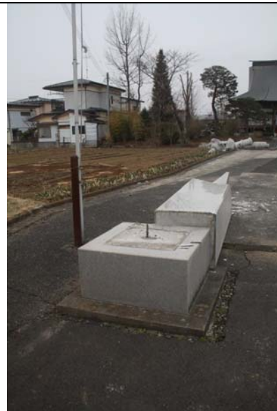
Photo 12: Fall down of two gateposts of the Kanro-ji temple to west