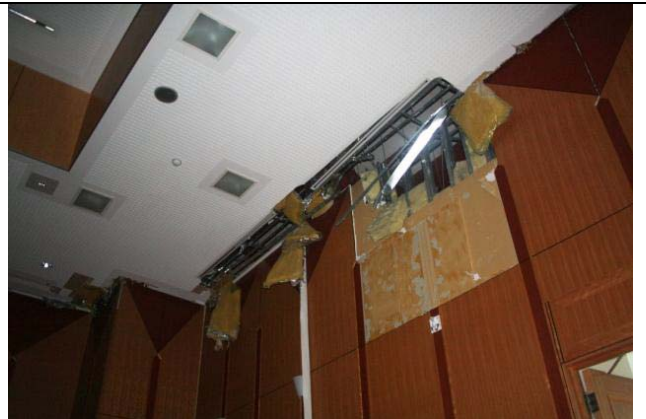
(b) Fall of ceiling of Municipal Assembly Hall (1)