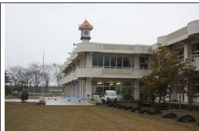
Photo 9: Overall view of Kurihara City Municipal Wakayanagi Elementary School

No damage was observed in the two story reinforced concrete Kurihara City Municipal Wakayanagi Elementary School Building, supported by pile foundation. Due to the soil settlement, 20 cm deep opening was observed (Photos 9 and 10). A statute fell down (Photo 11). The school master said “the large motion was felt in the east-west direction. The length of piles was told to be 30 m.” The gateposts of the Kanro-ji temple fell to the west near the school (Photo 12), and a large masonry lantern fell in a similar manner. The dominant frequency of the (H/V) ratio of horizontal to vertical spectra of micro tremor measurements at the Wakayanagi Elementary School after the 2008 Iwate-Miyagi Inland Earthquake was observed to be 0.8 Hz. In the neighborhood of the school, utility poles were tilted (Photo 13), cracking on the road, severe tilting of a timber house (Photo 14) in the second story were observed,