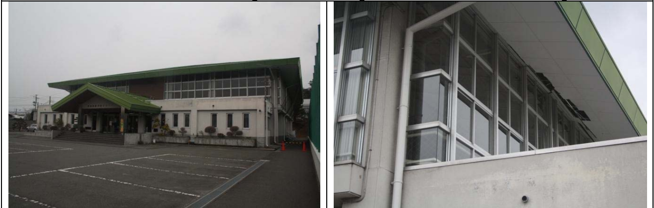
Photo 3: Tsukidate Gymnasium Center Building with minor non-structural damage