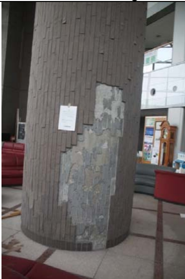
(c) Fall of finishing tiles on a column