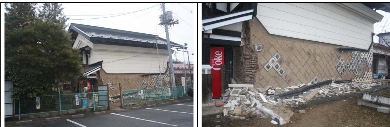
Photo 8: Fall of exterior mud finishing of traditional ware house walls