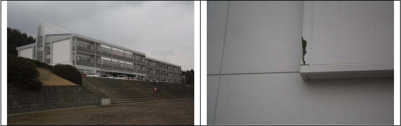
Photo 2: Tsukidate Junior High School Building with minor non-structural damage