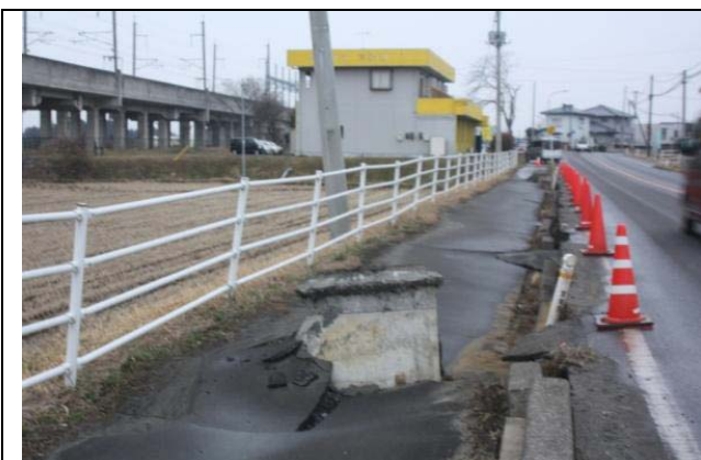
Photo 4: Lifting of a man hole due to soil liquefaction near Shiwahime