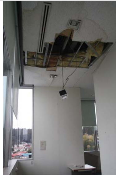
(d) Fall of ceiling of Municipal Assembly Hall (2)